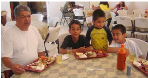
Grandfather and the boys at LFCC Dining Room